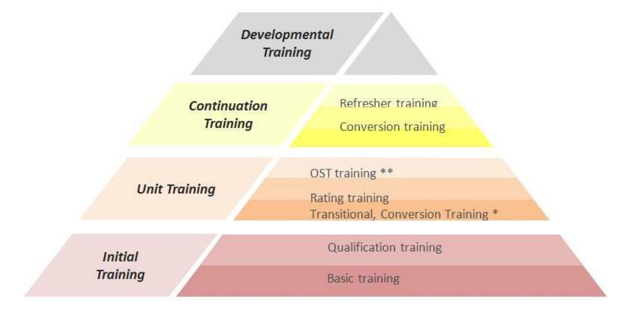
Figure 1: ATSEP Licensing and Training Phases

For the purposes of this requirements, the term ATSEP is used to describe "engineering and technical personnel who has been found competent to undertake operational safety related tasks on CNS/ATM systems and facilities".